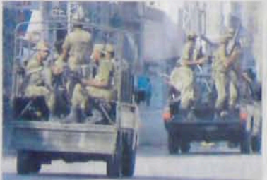
Pakistan Army troops prepare to leave for patrolling during a curfew in Bannu, a town on the edge of Pakistan's lawless tribal belt Waziristan, on Saturday.

MIR ALI Pakistan (AP) — Pakistan's army claimed Sunday to have killed 60 militants on the first day of an operation against an al-Qaeda and Taliban sanctuary close to the Afghan border that residents said was meeting stiff resistance from insurgents. The army said six soldiers had also been killed in the opening stages of the push into South Waziristan. "It was not possible to independently verify those figures because reporters have been stopped from getting close to the battlefield." The operation in South Waziristan follows repeated requests from the U.S. to take on the jihadists behind ongoing terrorist attacks in the nuclear-armed state, as well as al-Qaeda and other networks believed to be plotting strikes on the West. If credible, nearly 600